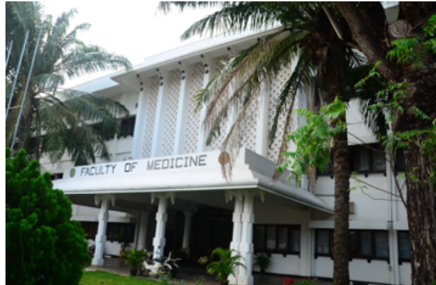
Figure 1: Faculty of Medicine, University of Jaffna

The Jaffna Medical Faculty, established in 1978 (Figure 1) is one of nine medical schools in Sri Lanka. The Colombo Medical Faculty (est. 1870) is widely considered the first western medical school in Sri Lanka and the second one in Southern Asia, after the Calcutta Medical College, India (est. 1835). However, five decades before the establishment of the Colombo Medical Faculty, a group of Missionaries from Boston, Massachusetts introduced western medicine into Northern Sri Lanka. They established a medical school and a hospital in Manipay, a small village 10 km from Jaffna which had considerable impact on the future development of western medicine in the northern region as well as in the wider island nation (Figure 2)