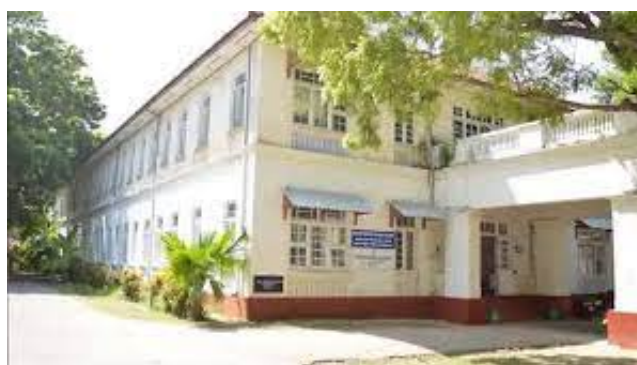
Figure 4: Green Memorial Hospital, Manipay (2021)

The pioneering aspect of SG in medical education and the training of medical