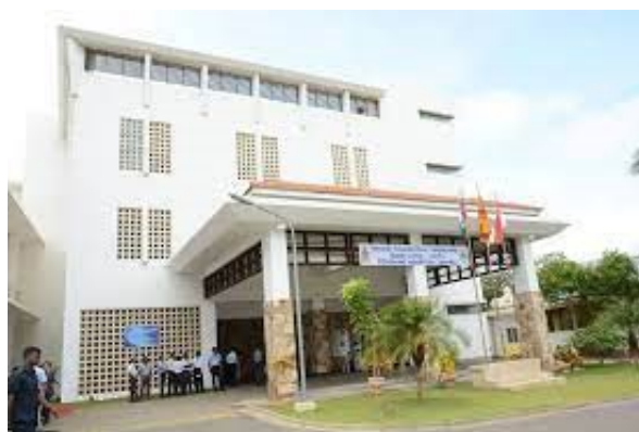
Figure 6: Jaffna Teaching Hospital, Northern Sri Lanka (2021).