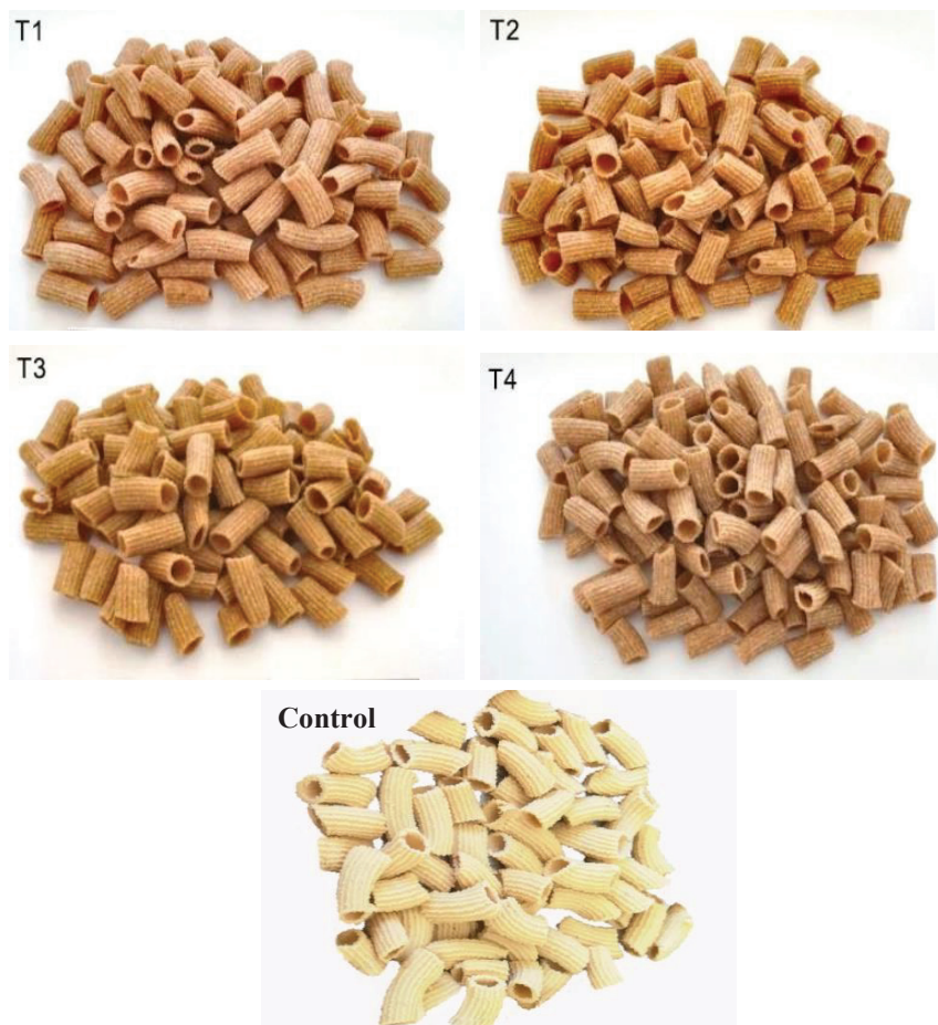
Figure 1. Pasta produced from the composite flour formulations.

Sensory evaluation of developed pasta samples was conducted using Hedonic scale (1-extremely dislike, 7-extremely like), with a panel of 36 semi-trained panelists on colour, aroma, taste, texture, and overall acceptability. The collected data was analyzed by non-parametric analysis, Friedman test using MNITAB (version 17).