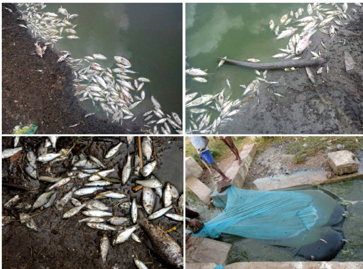
Figure-4 Fish death in Vavuniya reservoir happened during July to August, 2014