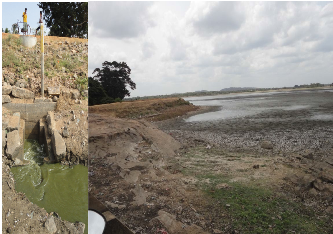
Figure-3 Over extraction for irrigation leads to Zero WL during Aug – Sep, 2014

Catch statistics for rainfall based quarters: In Vavuniya District during the past couple of decades (1992 - 2012) the heavy rainfall based quarters were found among Sep-Nov, Oct-Dec and Nov- Jan quarters (Table-1).