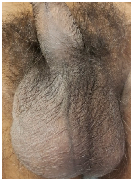
Fig. 2. Bilateral testicular swelling.

Prostatic carcinoma is a disease of the elderly, but it is not uncommon in men younger than 55 years [1]. Testicular metastasis from prostatic carcinoma is very uncommon [4]. However, the commonest primary site for testicular metastasis is the prostate (15 %) also testicular metastases might be considered an unusual additional factor of poor prognosis [6]. Prostate cancer commonly metastasizes to bones and lungs, but metastasis to the bilateral testis are rare and associated with a poor prognosis [7]. In a cohort study of 1589 patients with prostatic cancer hematogenous metastases were present in 35 % of patients [8]. The most frequent involvements were, bone (90 %), lung (46 %), liver (25 %), pleura (21 %), adrenals (13 %), and metastasis in the testes were found only in a few. Androgen deprivation therapy (ADT) with gonadotropin-releasing hormone (GnRH) agonists and antagonists is the mainstay of treatment in advanced prostate cancer [9,10]. In addition, combined hormonal therapy with chemo and radiotherapy improves outcomes in advanced prostate cancer [11]. The survival after diagnosing testicular metastasis of primary prostatic carcinoma is usually less than one year [12,13]. As in this case, the testicular metastasis can behave aggressively and further reduce the patient's survival.