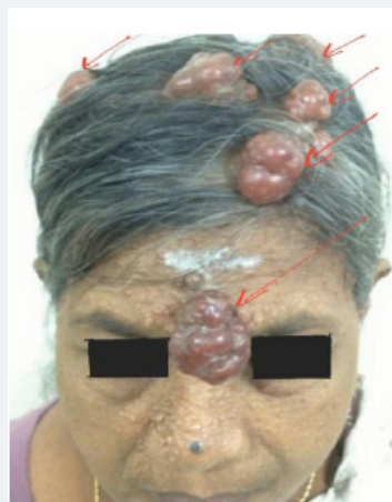
Figure 1: Multiple non-tender discrete soft skin coloured nodules measuring 3cm × 3cm distributed mainly over frontal, parietal and over the vertex of the scalp and firm papules measuring 2-8mm in diameter located mainly on the nasolabial folds, the nose, the forehead and the upper lip.