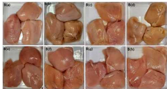
Figure 1. Representative pictures of chicken breasts (B). CON at 0d (a), LGA at 0d (b), PAW at 0d (c), PLGA at 0d (d), CON at 8d (e), LGA at 8d (f), PAW at 8d (g) and PLGA at 8d (h).

At 0.3 % concentration of organic acids was selected for the study based on preliminary studies. To prepare the LGA solution, 0.3% gallic acid and 0.3% lactic acid were mixed (1:1 v/v) and exposed by the plasma discharge for one hour using zirconium based on the preliminary experiment. Atmospheric air was used as the operating gas, and plasma was generated at 10 kHz and 2.0 kVpp. Chicken breasts and drumsticks were purchased from a local store and the skin was removed using a sterile knife. The samples were then cut into pieces weighing 50 \pm 0.1 g. Total 108 samples of each chicken type were randomly allocated into four treatments: deionized water (DDW), mixed lactic and gallic acids (LGA), plasma-treated deionized water (PAW), and plasma-treated LGA (PLGA). Each solution (200 mL) was treated with every 9 samples for 5 mins of the reaction time at room temperature ( 20 \pm 1^\circ\text{C} ). The samples were stored in separate containers under aerobic conditions at 4 \pm 0.5^\circ\text{C} , and were analyzed at 0, 4, and 8 days of storage. Several parameters including thiobarbituric acid reactive substance (TBARS), total bacterial count (TBC), pH, and color. TBC, pH, and color were measured immediately after sampling while the remaining samples were stored at -80^\circ\text{C} prior to TBARS analysis.