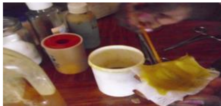
Fig-IV- Manjal karacheelai (Yellow corrosive gauze)

Total weight amount of white cloth was taken. Ingredients were mixed and grind to powder form. Then mixed with sterile water or Glycerin to get semisolid liquid foam. (Figure-v).