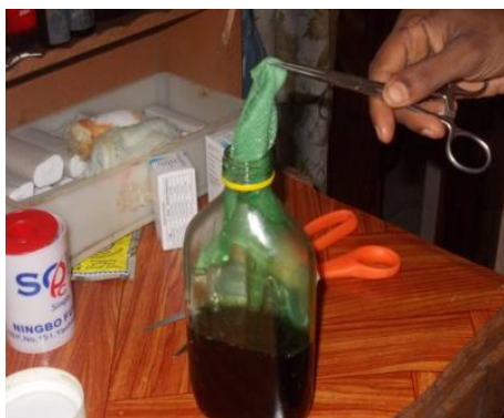
Fig-1 Pacha karacheelai (Green corrosive gauze)

All ingredients total weight amount of blue mixed and grinding as powder forms and mixed sterile water or Glycerin and mixed semisolid liquid form (Figure -I).