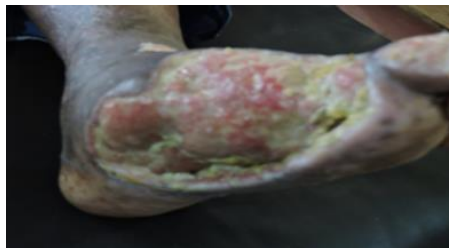
Fig-11 – Chronic Leg ulcer