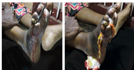
Fig-V &VI Probing of the Manjal karacheelai -Fistula of the wound

The above said gauze was used by the author to treat a patient with chronic diabetic leg ulcer. This 61 year female diabetes patient underwent allopathic treatment & surgery for chronic leg ulcer, end up with relapses and non-cure. Then she seeks Siddha treatment and it was done to cure leg ulcer using yellow corrosive gauze every other day for 10 weeks. At the end of treatment patient had complete relief by healed leg ulcer.