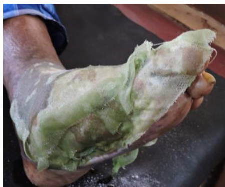
Fig-111 - Pacha karacheelai (Green corrosive gauze) application on chronic leg ulcer

Case Number- 2: A female patient aged 65 years presented with complaints of ulceration right side of the foot, blackish discoloration, and oozing of serous fluid with a foul smell for the last three months. The lesion started six months before with bluish discoloration on the dorsum of the foot then it gets reddish with a blister, then the pus oozes from the wound and it gradually spread over the foot skin with itching, serious watery foul smell secretion. The patient obtained surgical management at an allopathic hospital. Thereafter patient got mild symptomatic relief but it relapses repeatedly. Consequently, the patient seeks Siddha Ayurveda treatment and her health problem was diagnosed as a chronic diabetic wound.