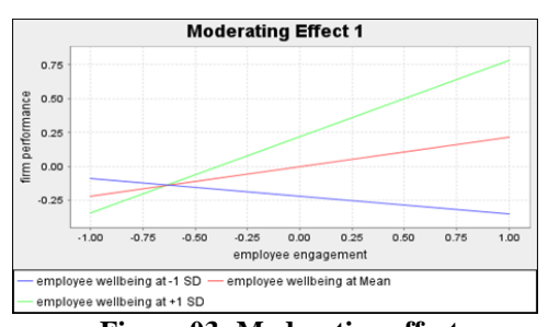
Figure 03: Moderating effect