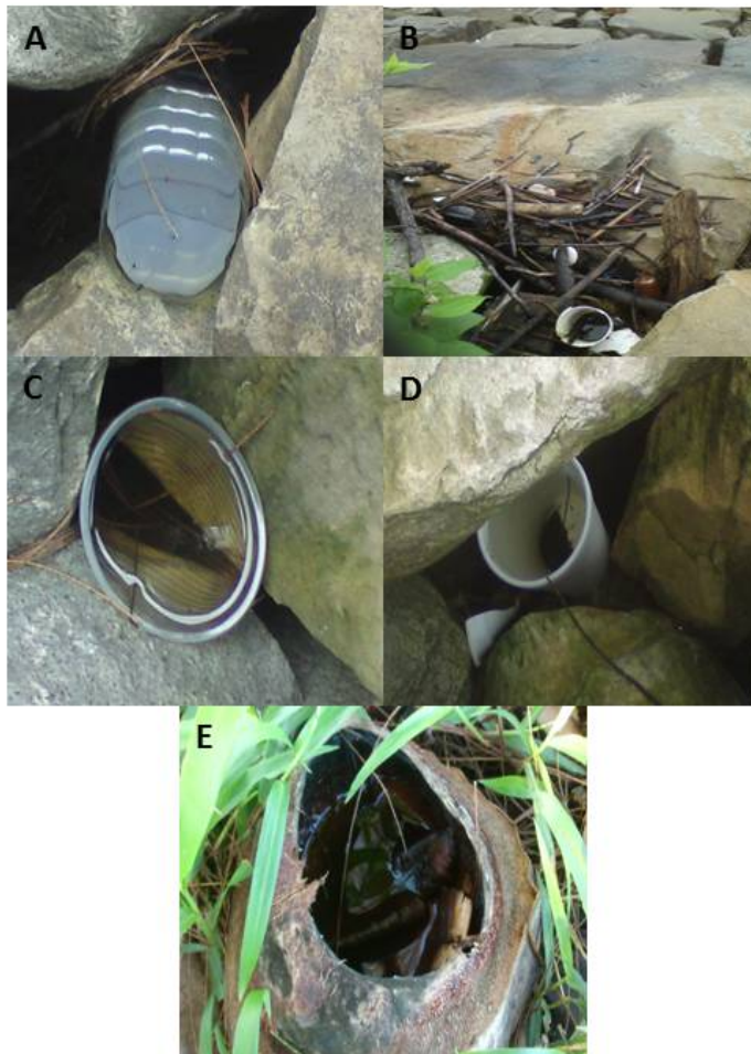
Figure 2. Brackish water collections where pre-imaginal stages of Aedes albopictus were found on the coast of Brunei Darussalam. (A) cut plastic bottle and (B) plastic cup in a rock pool at Serasa beach; (C, D) plastic cups in rock pools at Tungku beach; (E) coconut shell at Seri Kenangan beach.

The presence of the pre-imaginal stages of Ae. albopictus in brackish water of up to 8 ppt salinity in peri-urban settings in Brunei Darussalam builds on data from Sri Lanka that show Ae. albopictus in urban and peri-urban habitats of up to 14 ppt salinity (Ramasamy et al. 2011, Surendran et al. 2012). The LC_{50} for salinity in the transformation of 1 st instar larvae of Ae. albopictus to adults in the Jaffna peninsula of Sri Lanka was 13 ppt, with 100% survival to adulthood seen at 10 ppt salinity (Ramasamy et al. 2011). The possible higher salinity tolerance of Ae. albopictus in the Jaffna peninsula compared with Brunei Darussalam and a coastal location in mainland Sri Lanka may be attributed to adaptation to the more extensive groundwater salinization in the peninsula (Ramasamy et al. 2011, Surendran et al. 2012, Ramasamy and Surendran 2012).