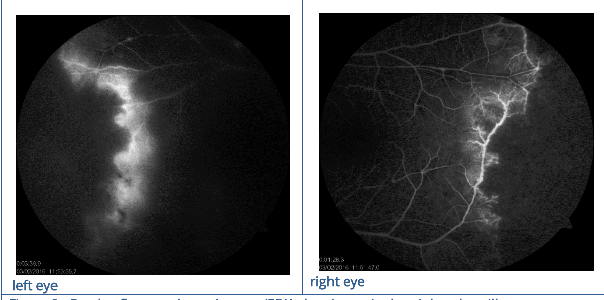
Figure 2 : Fundus fluorescein angiogram (FFA) showing retinal peripheral capillary non perfusions with periphlebitis

A fluorescein angiogram (FFA) was done which showed the presence of peripheral ischaemia as evidenced by retinal peripheral capillary non perfusions (capillary dropouts) with periphlebitis in both eyes (Figure 2).