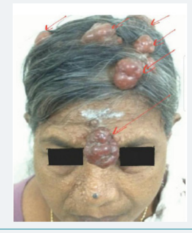
Figure 1: Multiple non-tender discrete soft skin coloured nodules measuring 3cm × 3cm distributed mainly over frontal, parietal and over the vertex of the scalp and firm papules measuring 2-8mm in diameter located mainly on the nasolabial folds, the nose, the forehead and the upper lip.