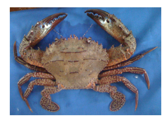
Fig. 4. Charybdis notator

Colour of C. notator is pale brown. Reddish brown tubercles scattered along the body. Dorsal surface of the carapace uniformly covered with soft woolly texture and marked with several reddish granulated transverse ridges.