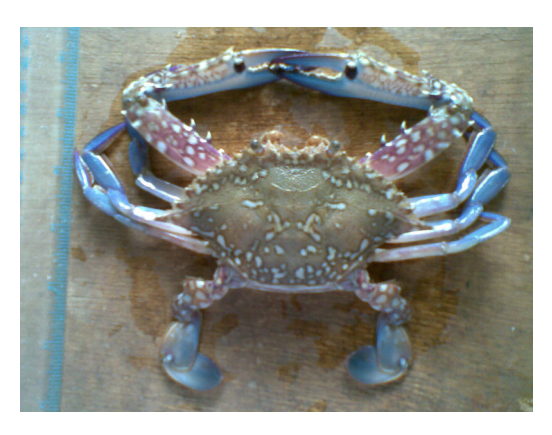
Fig. 3. Portunuspelagicus-Common name: Blue swimming crab

Colour of the male P.pelagicu s is pinkish-blue with extensive irregular white spots. The tips of the chelae and the distal segments of the legs are purple. Females are brownish colour with irregular patches.