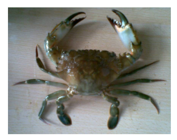
Fig. 2. Thalamitacrenata - Common name: Crenatatedthalamita

Colour of T. crenata consists of uniform greenish grey carapace and pinkish claws with dark brown tips, white extreme tips.