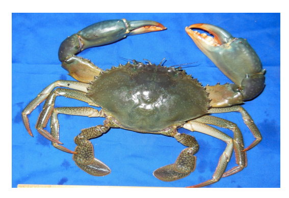
Fig. 6. Scylla serrate-Common name: Mud crab

S. serrate consists of orange colour cheliped (claw) tip and green to almost black body. The presence of polygonal markings on all limps and the two sharp spine on the outer margin of the carpus of the cheliped. Teeth of the anterio-lateral boarder of the carapace cut into nine. Legs are marbled. Smooth transverse ridges are present in the carapace.