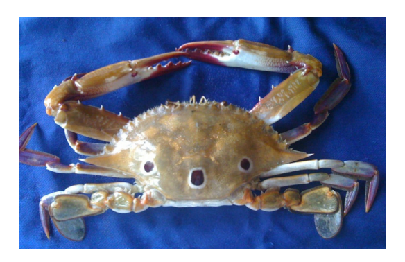
Fig. 5. Neptunussanguinolentes-Common name: Blood spotted swimming crab

Species Neptunussanguinolentes (Herbst, 1796)