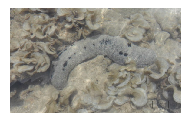
Fig. 2. Holoturiaatra