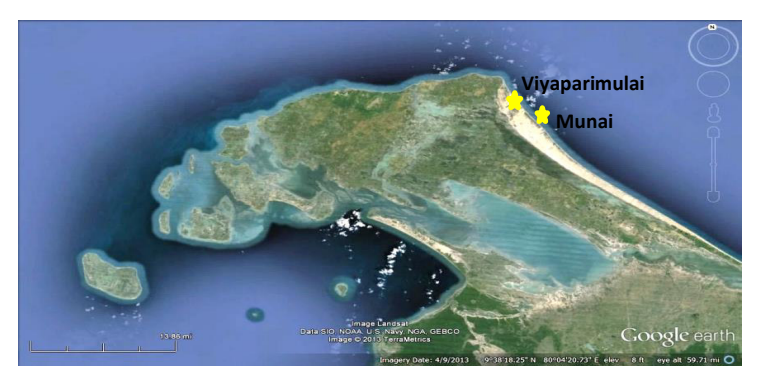
Fig. 1. Location of the study sites in coastal areas of Point Pedro Sample identification

This study was carried out during the period from May 2014 to June 2015. Two study sites were selected viz. , Viyaparimulai (N 9°49.912' E 80°13.517') and Munnai (N 09°49.659'E 80°14.889') (Fig. 1).Transects of 4 m width and 100 m length were made by direct visual assessment method on a monthly basis for the estimation of density and diversity of species at the two stations. using six replicates. Each transect was separated by a minimum distance of 5 m and data collections were carried out during low tide time only. The data obtained through the study were analysed with several diversity indices such as species richness, abundance, Shannon index and the Evenness index using PAST Software version 2.17c.