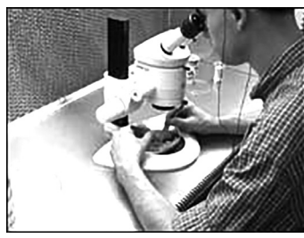
Immature embryos are removed from seeds and placed on media. Callus cells will then begin to grow from them.