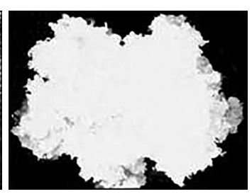
Callus is masses of undifferentiated cells.

Since plant cells are totipotent, growth hormones can be added to the media triggering the callus cells to develop roots, shoots and eventually entire plants. Plants regenerated from tissue culture will be clones genetically identical to the cell they originated from.