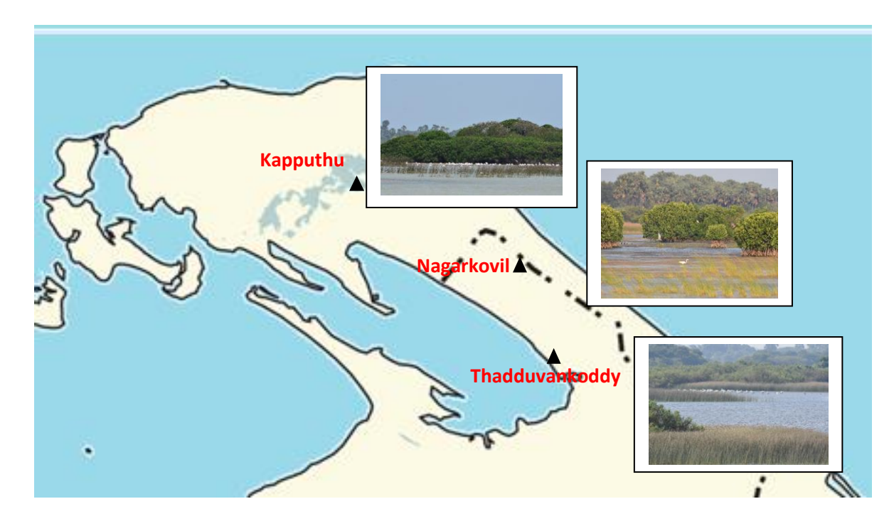
Figure 01. The three study sites, Thadduvankoddy, Kapputhu and Nagarkovi

The present study was carried out in three locations namely, Thadduvankoddy in the Kandavalai DSD (9 ^{0} 30' 0" N, 80 ^{0} 25' 0" E), Kapputhu in the Vadamaradchi South West DSD (9 ^{0} 44' 09" N, 80 ^{0} 10' 48" E), and Nagarkovil in the Vadamaradchi East DSD (9 ^{0} 36' 00" N, 80 ^{0} 17' 00" E).