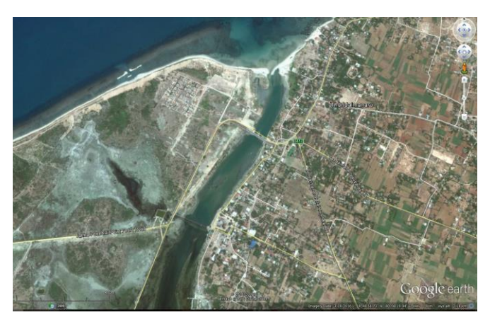
Figure 1: Location map of Thondaimanaru lagoon (Source: Google earth)

Thondaimanaru lagoon (Figure 1 ) is located in North coast of Sri Lanka and situated between 80° 08'E - 80° 29'E longitudes and 9° 34'N – 9° 49'N (Chitravadivelu, 1978). Thondaimanaru lagoon is covered with 75 km<sup>2</sup> of surface area and 287 km<sup>2</sup> of catchments area (Sivakumar, 2013). The lagoon is shallow and brackish. It directly opens up to the Palk Strait of the Indian Ocean and mouth is naturally opened and closed due to the tidal action.