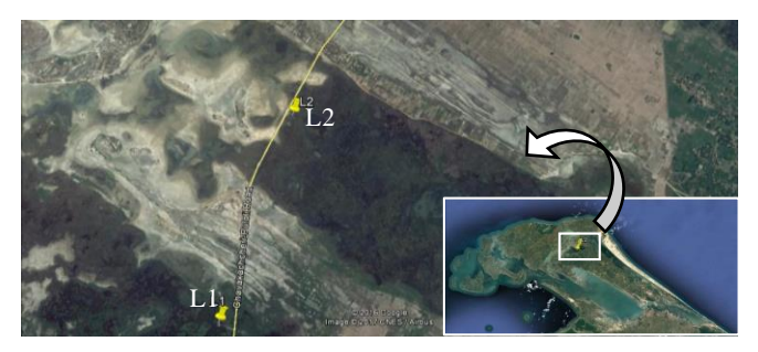
Figure 1: Sampling locations in Jaffina Peninsula: Sarasaalai (L1) and Kapputhu (L2)

Samples were collected in the second week of each month (from June 2016 to November 2016). Water samples and soil samples were collected by using water sampler, and mud sampler, respectively. Random samples of fishes were collected from fishermen once a month.