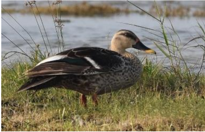
Figure 4: Spot-billed duck ( Anas poecilorhyncha ) in Kayts.