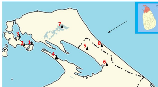
Figure 1: The eight study sites denoted with numbers. 1: Mandaitiv, 2: Mankumban, 3: Kayts, 4: Kavutharimunai, 5: Pallai, 6: Thadduvankoddy, 7: Kapputhu and 8: Nagarkovil.

to avoid double counting as most were open areas. All the waterbirds seen on either side of the transect up to 500 m were counted during dawn and noon or dusk on alternate months to capture temporal variations by walking along the transect line of each block. Waterbird counting was done by ferry in Kavutharimunai with the help of the Fisheries' Society, Maniththalai, Kavutharimunai. Waterbird species were identified using a standard field guide (Harrison, 2011). Counting blocks were visited once a month from December, 2016 to May, 2017. Then a list of status of waterbirds was prepared following Harrison, 2011 and Wijesundara et al. , 2017.