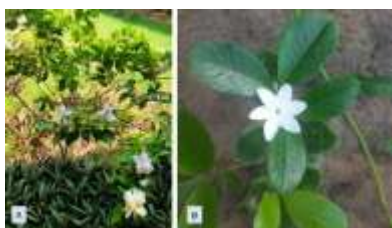
Figure 2. Morphotypes of Gardenia (A- G. jasminoides , B- G. taitensis )

Two morphologically distinct Gardenia species, Gardenia jasminoides and Gardenia taitensis , were identified in the Jaffna and Mullaitivu districts based on floral and foliar characteristics. Both of them produce white flowers; however, there are notable differences in their fragrance profiles. G. jasminoides is characterized by a strong, sweet fragrance, which is more intense compared to that of G. taitensis .