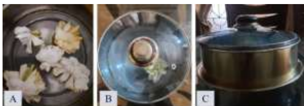
Figure 1. Essential oil production of Gardenia (A- collection of Gardenia flowers, B - Placing of flowers on the sieve, C- Allowing the volatile compounds to infuse into the oil)

Fresh flowers of G. jasminoides were collected. A thin layer of refined coconut oil was spread on a plate, and a sieve was placed above the plate. The flowers were then placed on the sieve, allowing the volatile compounds to infuse into the oil. After 10 - 12 hours, the infused oil was collected and stored in a glass bottle. The fragrance of the infused Gardenia oil was evaluated by 15 persons from the first day of production up to six months of storage.