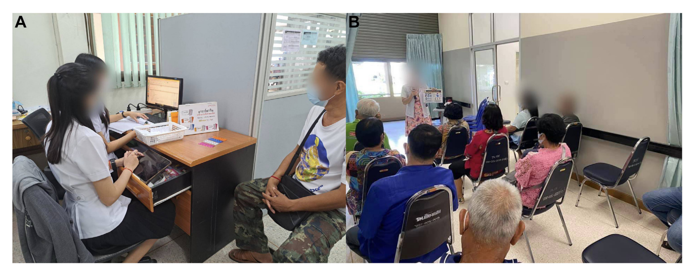
Figure 1 A: Warfarin education for individual patients in rural hospital by healthcare personnel. B. Group education for atrial fibrillation complication and management in a rural hospital in Thailand.

forward and backward translation by bilingual experts. A trial of the Thai version among AF patients with varying levels of education and age was conducted, incorporating patient feedback to optimize the usability of the intervention. The TREAT study demonstrated that a single educationalbehavioral intervention (TREAT intervention) for warfarin in AF patients notably enhanced TTR at 6 months compared with standard care alone. 17,18 However, implementing such interventions universally for all AF patients on warfarin may not be feasible. Identifying patients less likely to achieve optimal INR control and delivering a structured educationalbehavioral intervention as needed could offer a practical and cost-effective management strategy. The SAMe-TT2R2 score, which includes demographic and clinical variables has developed to identify likelihood of achieving suboptimal TTR in patients with a score \geq 2 .