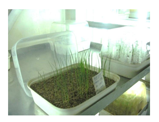
Figure 4: seedlings of Bg352on sand in a germination box.