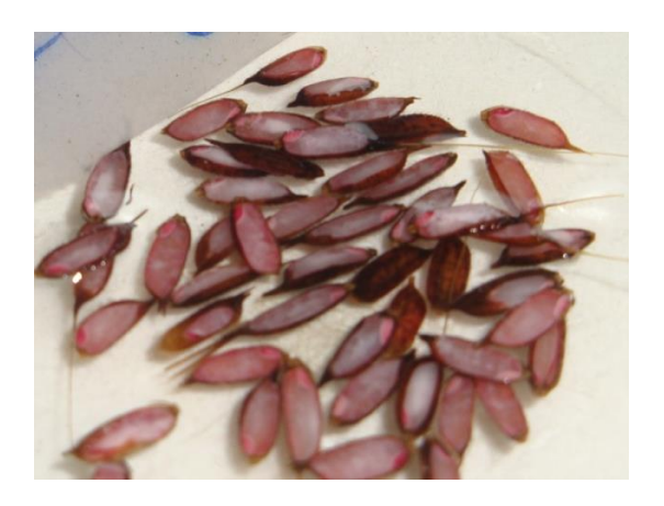
Figure 1 : Appearance of red coloured viable embryos of O. rhizomatis after treatment 4.4.