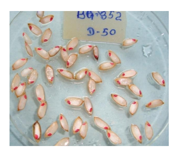
Figure 2: Appearance of red coloured viable embryos of Bg352 after treatment